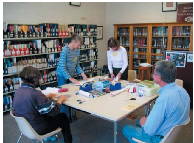
Above: Volunteer book carers hard at work

Why not join us for a friendly interesting discussion over coffee?