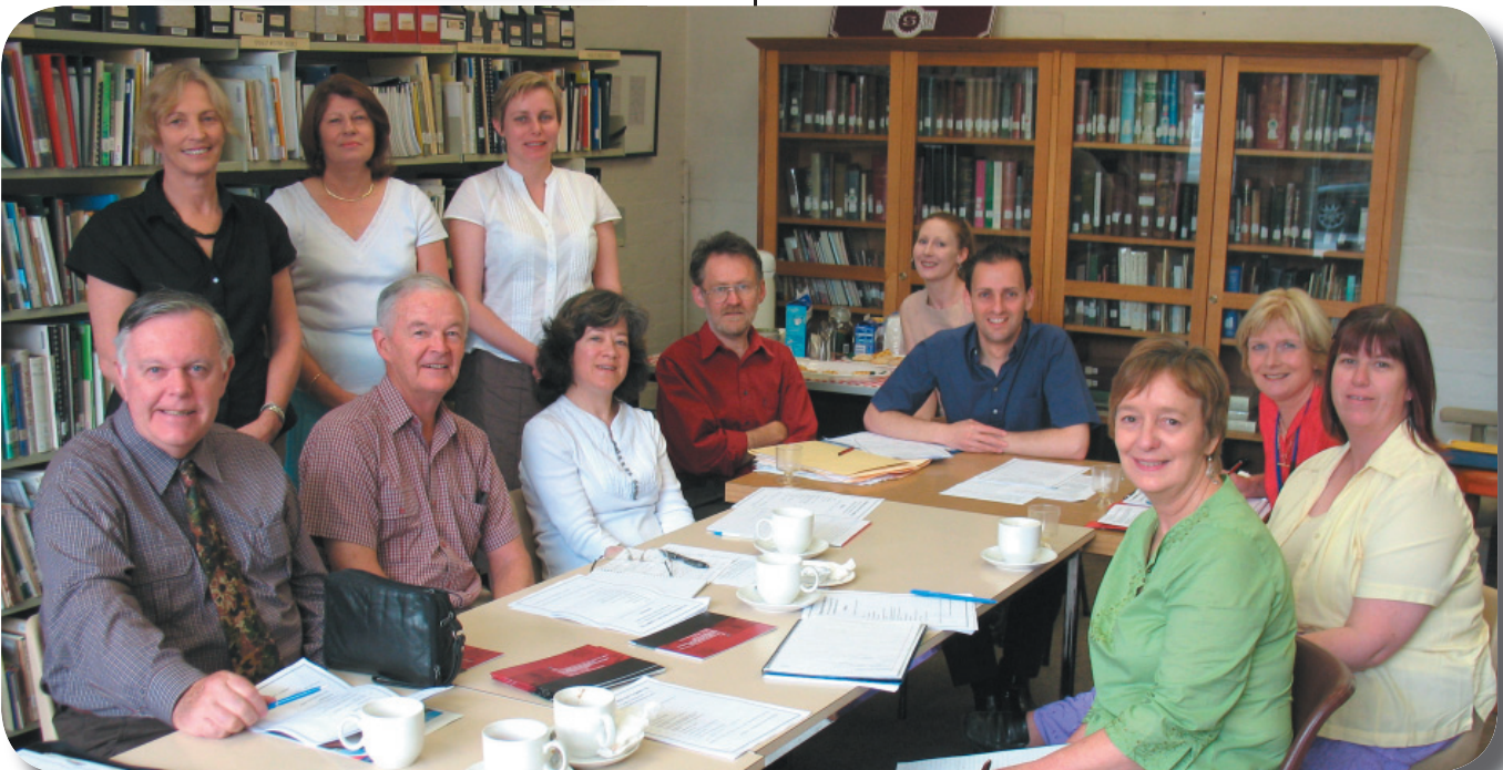
Above: The Stonnington History Committee at the Prahran Mechanics' Institute

These meetings provide PMI staff with the opportunity to keep up with the local history and library scene and hear some excellent guest speakers.