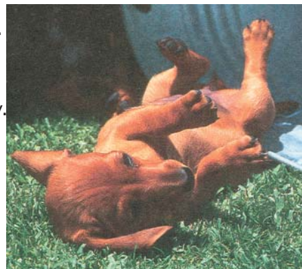
Above: The warm, cuddly feeling you get when you help non-profit community organisations.